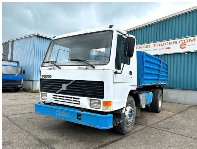
Volvo FL 7-230 4x2 FULL STEEL 3-WAY KIPPER (MECHANICAL PUMP & INJECTORS / MANUAL GEARBOX / FULL STEEL SUSPENSION / HYDRAULIC KIT)