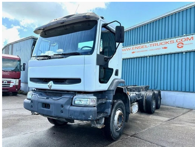
Renault Kerax 320 6x4 FULL STEEL CHASSIS (MANUAL G...