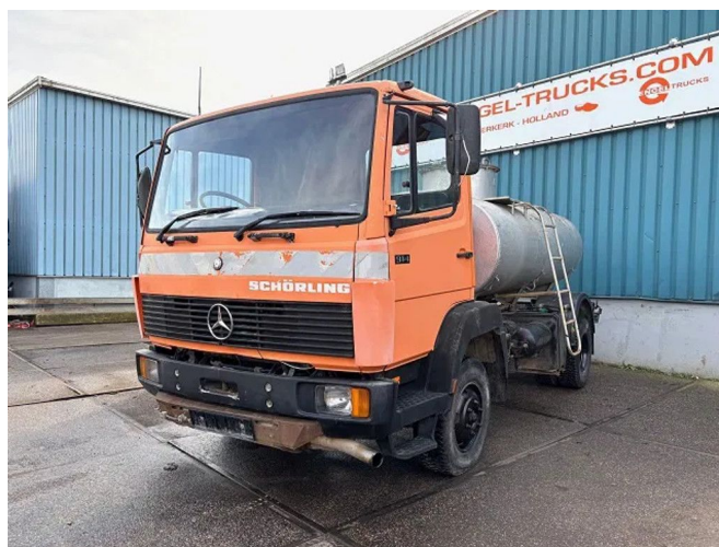
Mercedes-Benz LK 914KO RHD 4x2 FULL STEEL TANK TR...