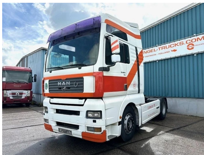
MAN TGA 18.460 FLS XXL (6 CILINDERHEADS!!) (ZF1... 4x2 Referentienummer: SN 56429608