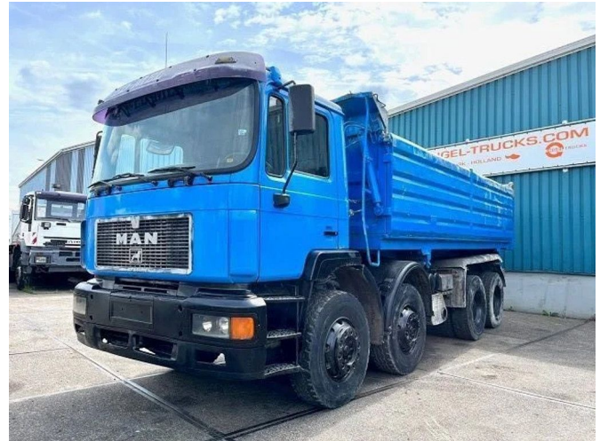
MAN 41.464 F2000 8X4 FULL STEEL KIPPER (EURO 2 / ZF... Referentienuummer: SN 55149234 Z