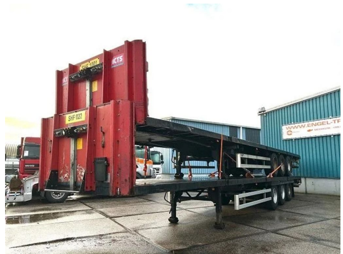
LAG O-3-39 13.60 METER 3-AXLE FLATBED (DRUM BRAK...