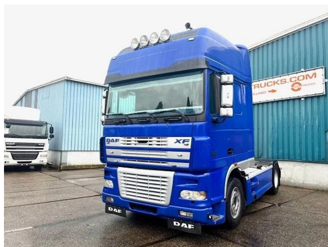
DAF XF 530 SUPERSPACECAB 4x2 TRACTOR UNIT (EURO...