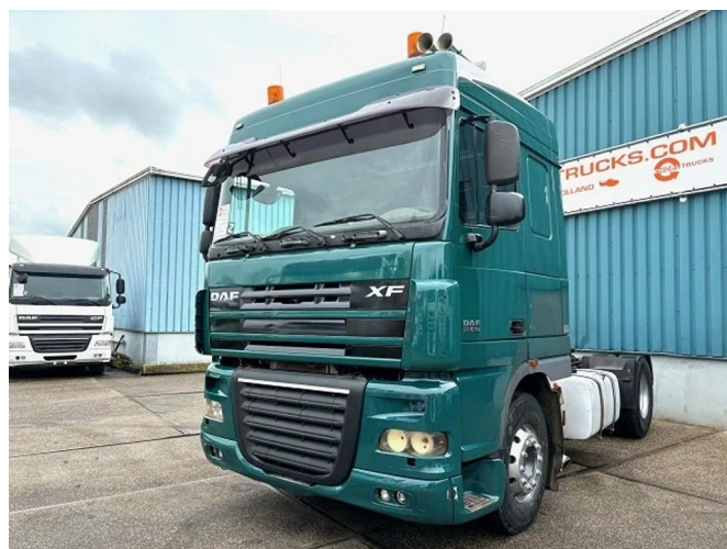
DAF XF 105.460 SPACECAB WITH KIPPER HYDRAUL... 4x2 Referentienummer: SN 54382658 Z