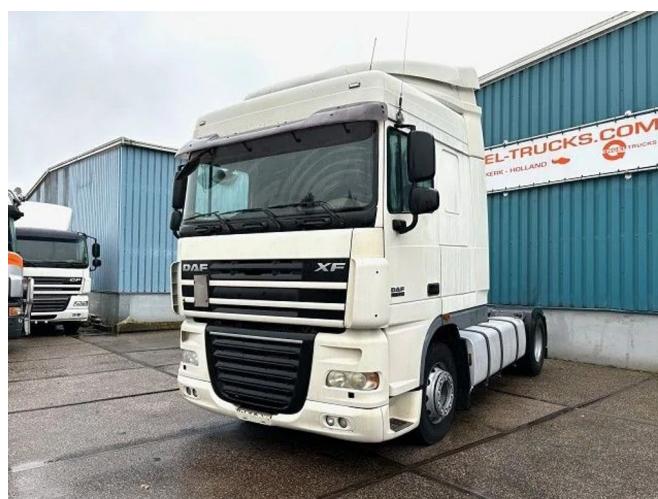
DAF XF 105.410 SPACECAB (ZF16 MANUAL GEARB... 4x2