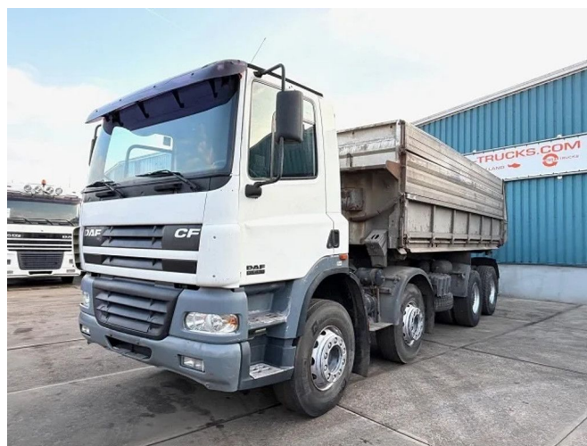
DAF CF 85.430 8x4 FULL STEEL 20m3 KIPPER (EURO 3 / ... Referentienumer: SN 56253918