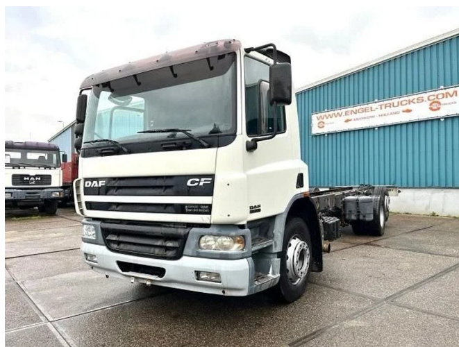
DAF CF 75.250 6x2 DAYCAB CHASSIS (EURO 3 / ZF MAN...