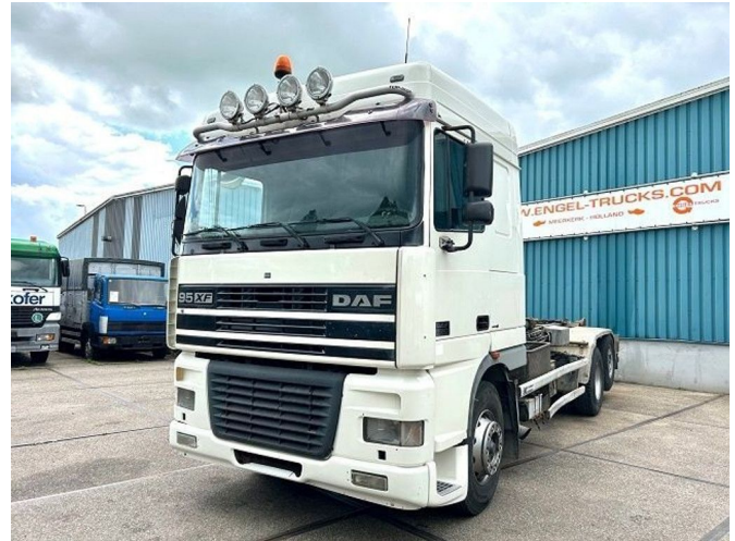
DAF 95.480 XF SPACECAB 6x2 WITH HOOK-ARM SYSTEM... Referentienummer: SN 55179427