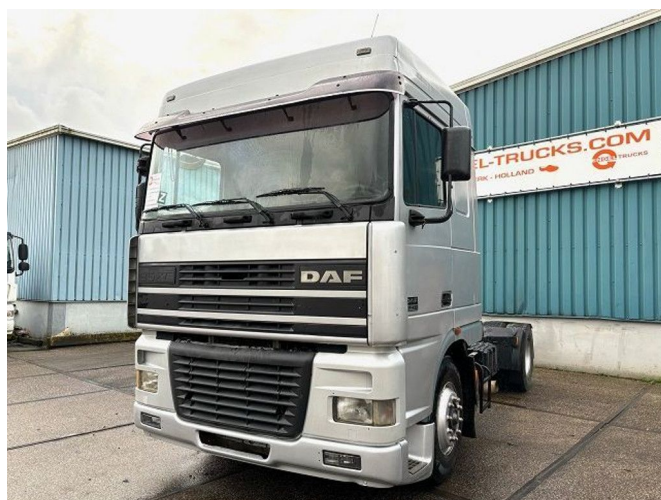
DAF 95.430 XF SPACECAB (EURO 2 / ZF16 MANUAL ... 4x2