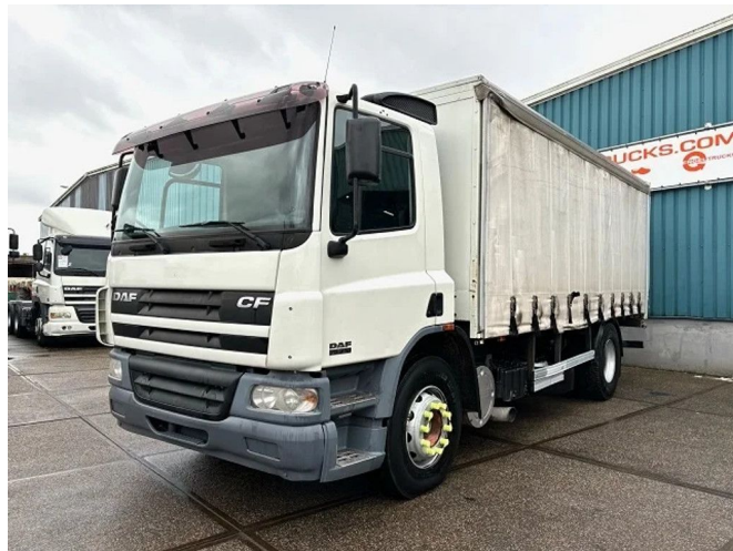
DAF 75 .310 4x2 WITH CURTAINSIDE BOX (EURO 3 / MAN...