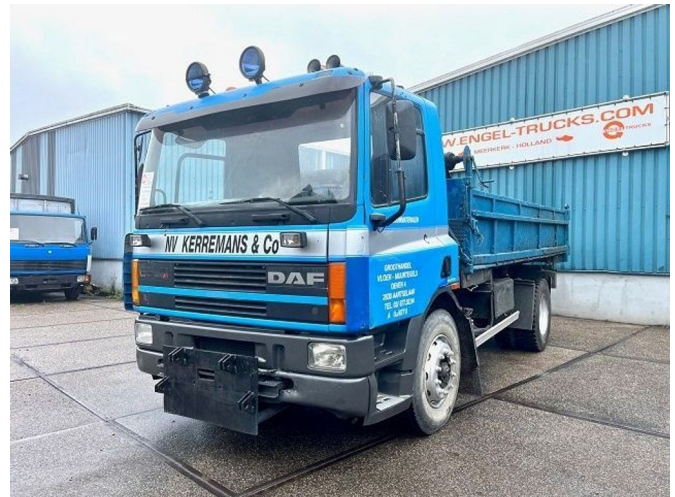
DAF 65.210 ATI 4x2 FULL STEEL KIPPER (EURO 2 / MANU...