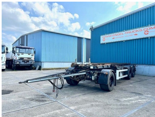
Burg BPA09-18AC 3-AXLE CONTAINER HANGER (SAF AXL...