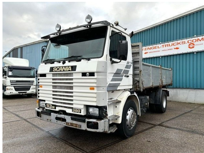
Scania R113-380 H 4X2 MEILLER KIPPER (FULL STEEL SU...