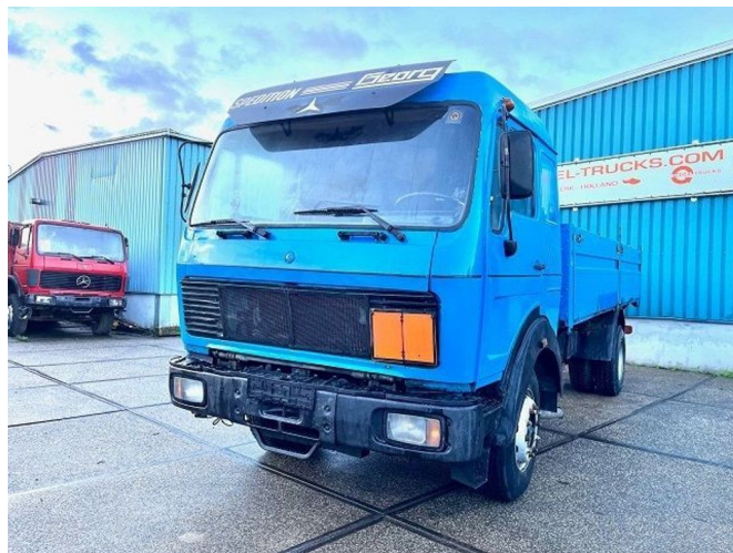
Mercedes-Benz SK 1635K GROSSRAUM 4x2 FULL STEEL ...