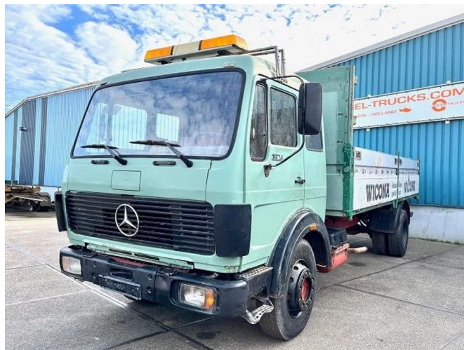
Mercedes-Benz SK 1624 V8 SLEEPERCAB WITH OP... 4x2 Referentienummer: SN 54574025