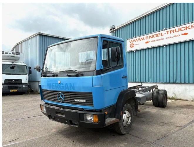
Mercedes-Benz LK 914K (6-CILINDER) FULL STEEL C... 4x2