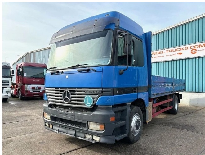
Mercedes-Benz Actros 1840 L (MP1) 4x2 STEEL-AIR SUSP...