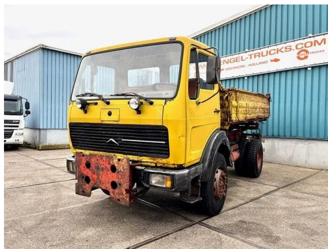
Mercedes-Benz 1617 AK 4x4 FULL STEEL 3-WAY MEILLER ... Referentienummer: SN 55703771