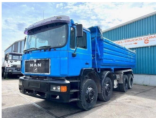
MAN 41.464 F2000 8X4 FULL STEEL KIPPER (EURO 2 / ZF... Referentienummer: SN 55149234 Z