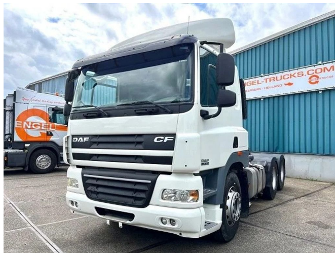
DAF CF 85.410 6x4 HEAVY DUTY TRACTOR UNIT (EURO 5 ... Referentienummer: SN 55355601 Z