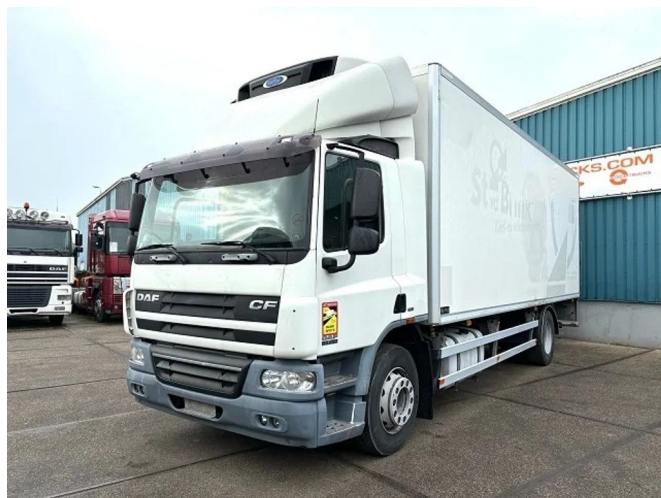
DAF CF 65.250 COOLING TRUCK WITH CARRIER D/E... 4x2