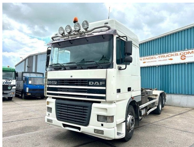
DAF 95.480 XF SPACECAB 6x2 WITH HOOK-ARM SYSTEM...