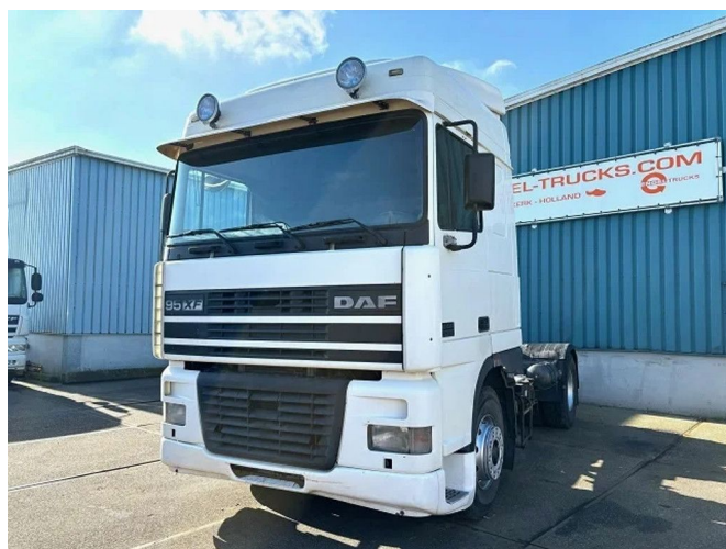
DAF 95.380 XF SPACECAB (EURO 2 / ZF16 MANUAL ... 4x2