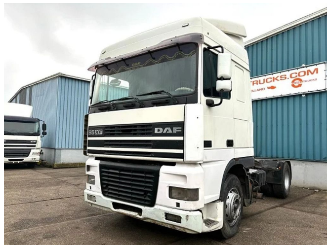
DAF 95.380 XF SPACECAB (EURO 2 (MECHANICAL ... 4x2 Referentienummer: SN 56068266 Z