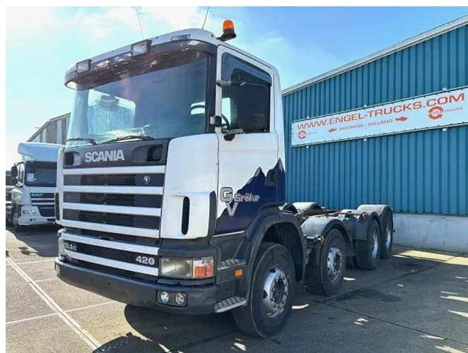
Scania R124-420 C 8x4 FULL STEEL CHASSIS (EURO 3 / F...