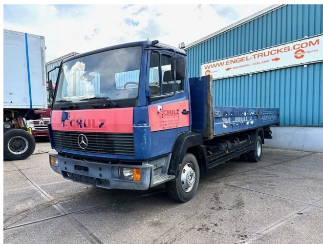
Mercedes-Benz LK 814 (6-CILINDER) FULL STEEL SU... 4x2