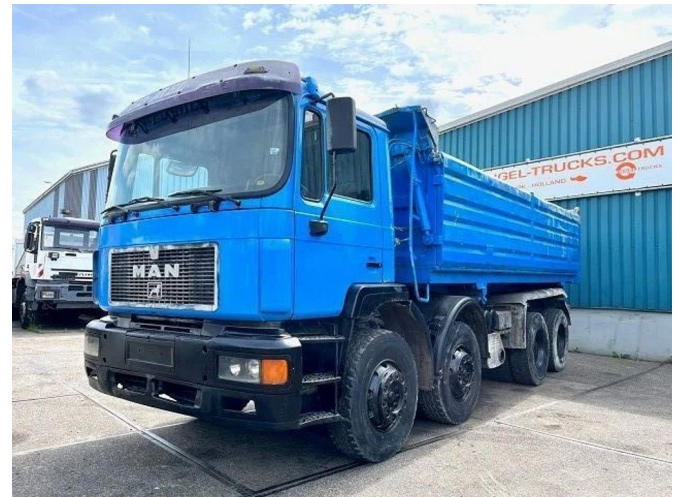
MAN 41.464 F2000 8X4 FULL STEEL KIPPER (EURO 2 / ZF... Referentiennummer: SN 55149234 Z